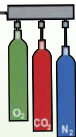
MAP GAS Flushing(900F)